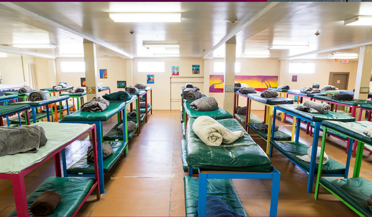
EMERGENCY SHELTERS/ TRANSITIONAL HOUSING